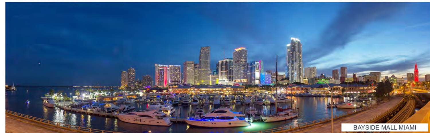
BAYSIDE MALL MIAMI