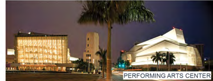
PERFORMING ARTS CENTER

SUN & BEACHES ART & CULTURE NIGHTLIFE & DINING CONTEMPORARY EVENTS