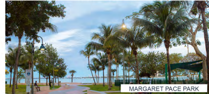
MARGARET PACE PARK

3 MINUTES TO I-95 / 395/ 195 3 MINUTES FROM THE AMERICAN AIRLINES ARENA 10 MINUTES TO SOUTH BEACH A FEW BLOCKS FROM THE PERFORMING ARTS CENTER 15 MINUTES TO MIAMI INTERNATIONAL AIRPORT